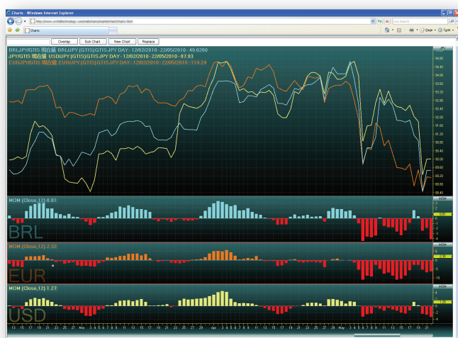
Compare multiple currency pairs in single chart

MarketChart gives you the tools to monitor and analyse essential market movements for your selected instruments