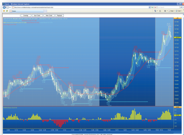
Zoom to examine data - each price tick can be captured