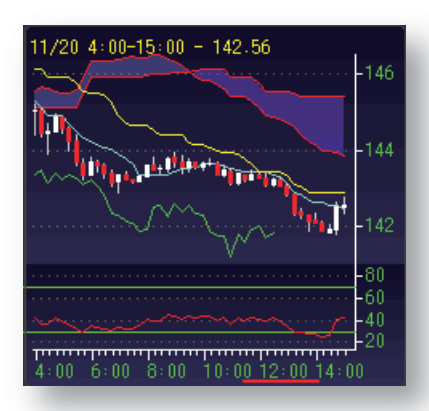
15min GBP/JPY IKH chart with RSI

Zoom and Scroll functions control the amount of visible data, allowing closer inspection of key points on the chart, or a view of the full data set. In Target Cursor mode the vertical cursor can be moved across the data, and additional information for the selected point displayed.