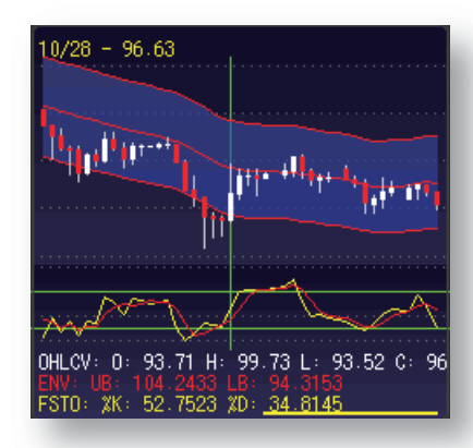
daily USD/JPY envelope chart with FSTOC